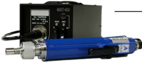
CT5407 / CT5408 Transformer / Electric Driver