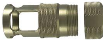
CT5408-PA Prewinder Adapter